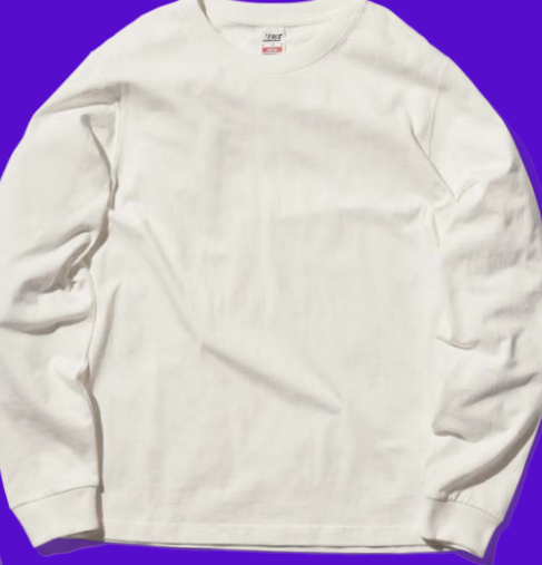
Ready To Dve