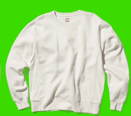
Ready To Dye