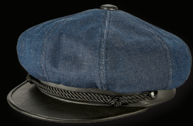
6075 Denim Brando