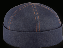
6245 Denim Thug