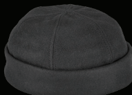
7915 Wool Thug