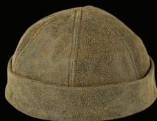
9298 Antique Leather Thug