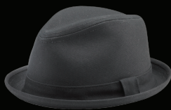
3105 Canvas Fedora