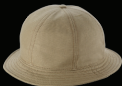
3095 Canvas Tennis