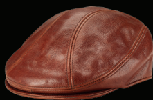
9214 Vintage Leather 1900