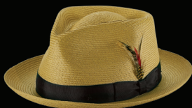
2319 Sewn Pinch