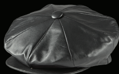
9209 Lambskin Big Apple