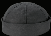
6264 Canvas Thug