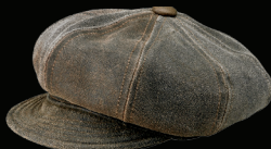
9245 Antique Leather Spitfire