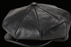
9253 Lamba Newsboy