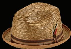
2122 Coconut Stingy