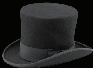
5009 Mad Hatter