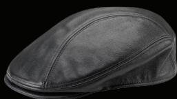
9250 Lamba 1900