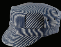
6254 Hickory Engineer