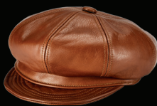
9223 Vintage Leather Spitfire