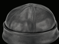
9295 Lamba Thug