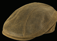
9255 Antique Leather 1900