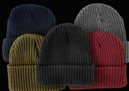
4648 Chunky Cuff

One Size • Black, Brown, Burgundy, Charcoal, Copper, Navy, Mustard, Olive, Red, Stone, Teal