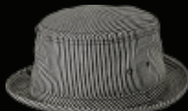
3060 Hickory Stingy