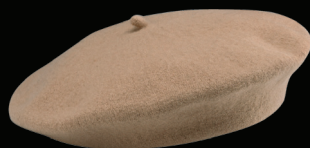
4000 10-1/2 Inch Wool Beret

Black, Camel, Charcoal, Maroon, Navy, Olive, Orange, Oxford Grey, Pink, Red, Sky Blue, White, Yellow