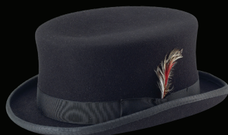
5014 The Gent