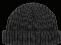
4660 Chunky Skull