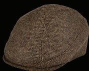
9333 Herringbone 1900