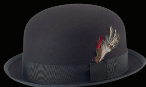
5002 Laurel Derby