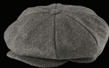
9035 Wool Newsboy