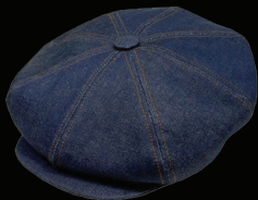
6291 Denim Big Apple