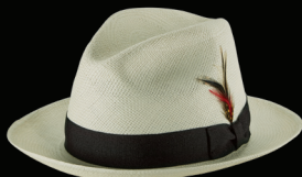
2078 Panama Fedora