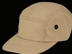
6060 Rip Stop Camp