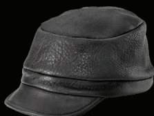
9112 Lamba Worker