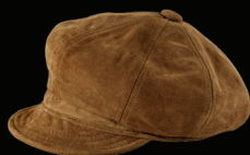
9260 Suede Spitfire