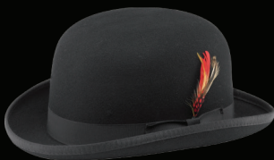
5007 Classic Derby