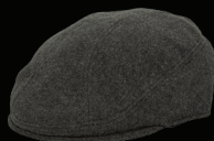
9003 Wool Melton 1900