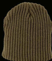
4655 Chunky Beanie