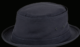
3014 Canvas Stingy