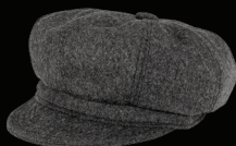
9055 Wood Spitfire