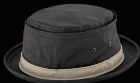
3061 Cotton Stingy