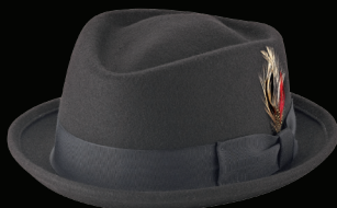
5250 Diamond Crown