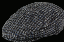
9022 Harris Tweed 1900