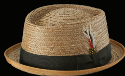
2130 Coconut Be-Bop