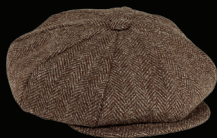
9038 Herringbone Newsboy