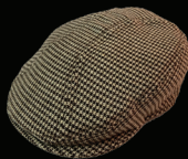
9340 Houndstooth 1900