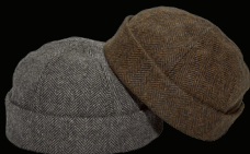
7920 Herringbone Thug