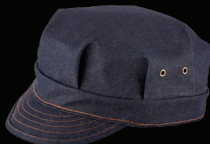
6267 Denim Engineer