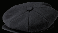
9080 Wool Big Apple