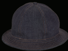
3024 Denim Tennis