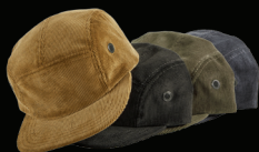
9362 Corduroy Camp Cap