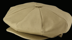
6226 Canvas Big Apple