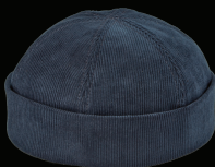
7934 Corduroy Thug