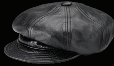
9207 Lambskin Spitfire