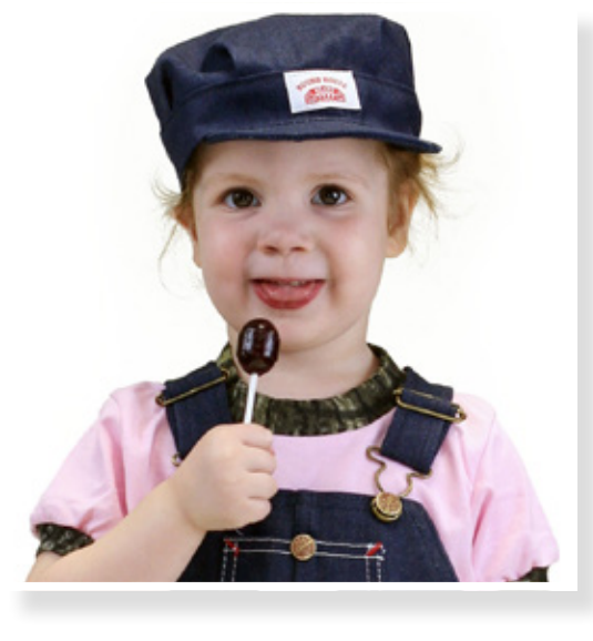
#87 Kid's Railroad Caps