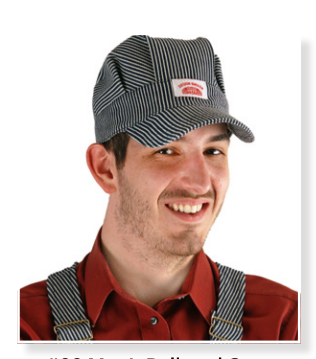
#88 Men's Railroad Caps