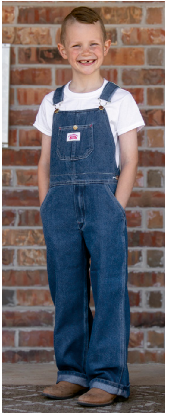
Sizes 2T to 7 have a zipper fly.