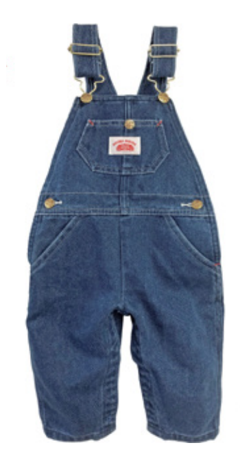
Sizes 12 Mo, 18 Mo, and 24 Mo have snaps along the legs for easy diaper changing.