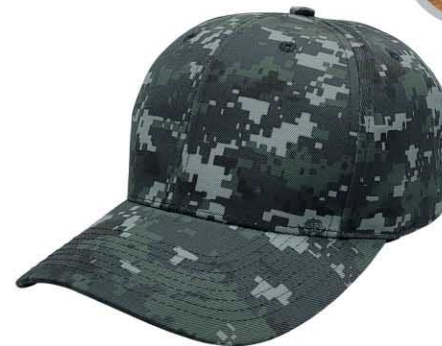
KL100ND NAVY DIGITAL CAMO POLY COTTON