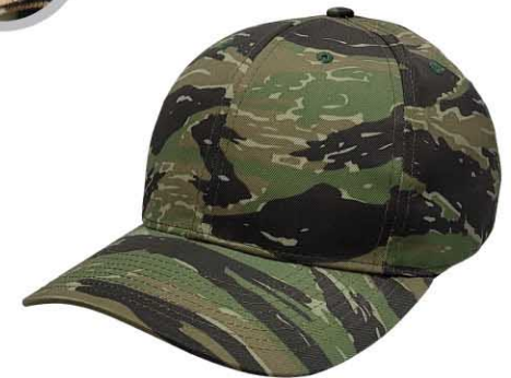
KL100TG TIGER GREEN CAMO POLY COTTON