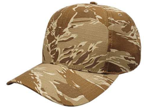
KL100TT TIGER TAN CAMO COTTON RIPSTOP