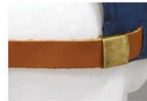
METAL FLIP BUCKLE