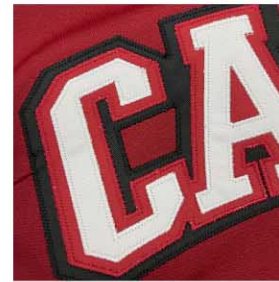
LASER ETCHED TACKLE TWILL

FELT/LEATHER/SUBLIMATED FABRIC/TACKLE TWILL/VINYL