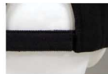
HOOK AND LOOP