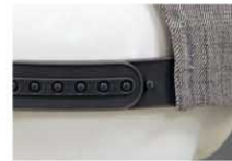
PLASTIC POLYSNAP (SNAPBACK)