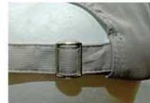
HIDEAWAY SLIDE BUCKLE