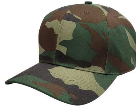
KL100WC WOODLAND CAMO POLYWOOL

6 PANEL STRUCTURED CURVED BILL with GREEN UNDERVISOR MID CROWN