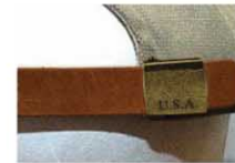
EMBOSSD FLIP BUCKLE