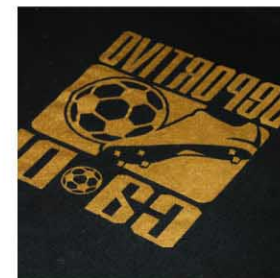
SCREEN PRINT TRANSFER