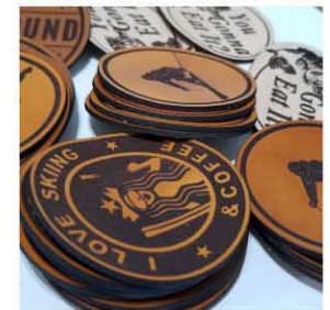
LASER ETCHED PATCH