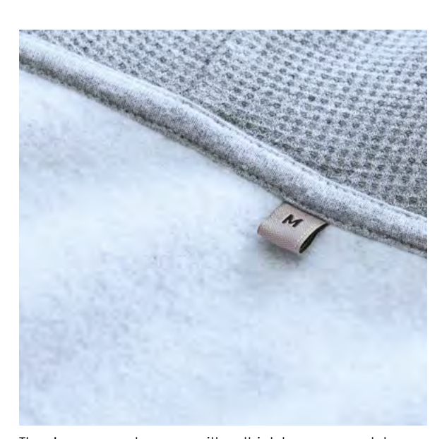
They're so cosy to wear with a thick bouncy neck tape and a super-soft inner fleece.

No detail is too much trouble, including the addition of a self-coloured size label.