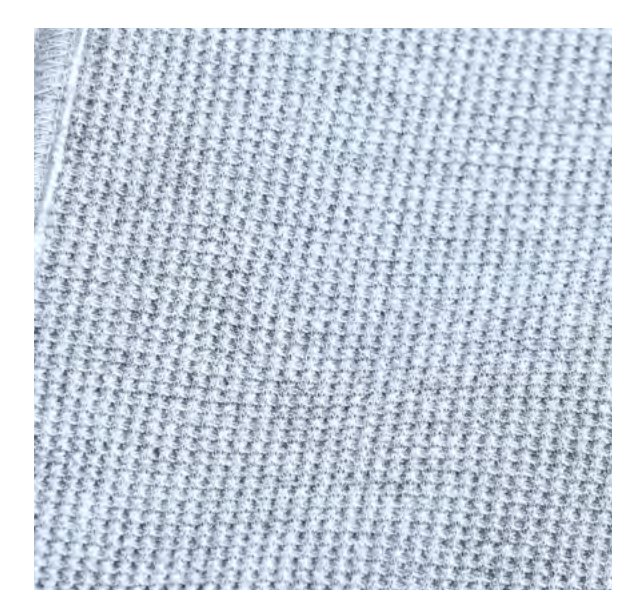
Our hoodies are luxuriously warm and thick thanks to double-layer fabric and a waffle knit hood lining.