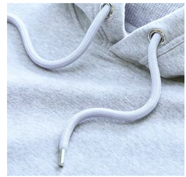
The jumbo drawcords are perfectly colour-matched and finished with a high-shine metal aglet.