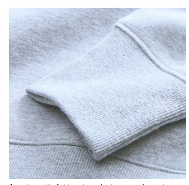
Superb quality finishing includes twin-needle chain stitching to the hem, sleeves shoulders and nape.